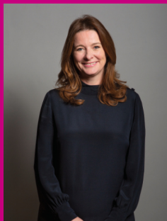
Gillian Keegan MP

During National Apprenticeship Week 2021, we officially launched We invest in apprentices.